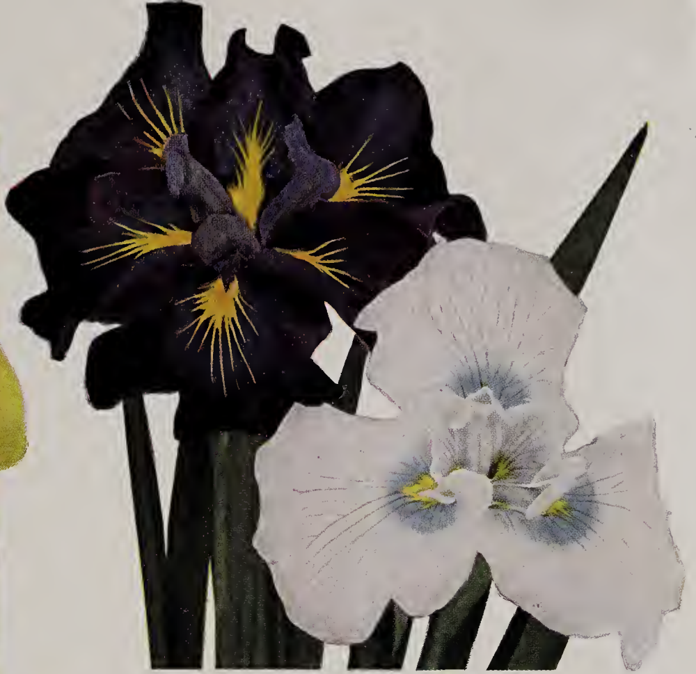
Purple and Gold